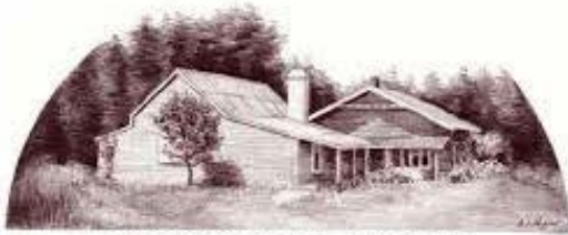
MOUNT MARY VINEYARD YARRA VALLEY